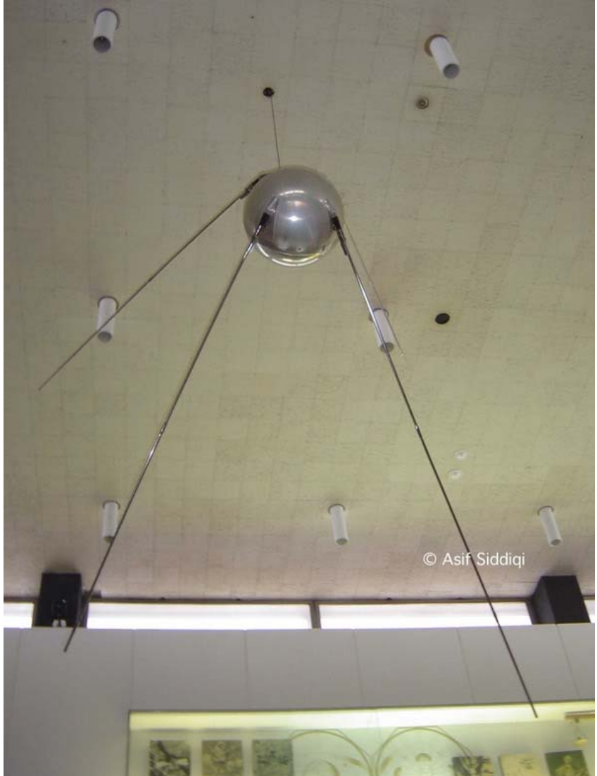
A model of Sputnik at the Memorial Museum of Cosmonautics in Moscow.